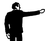
Point in Line